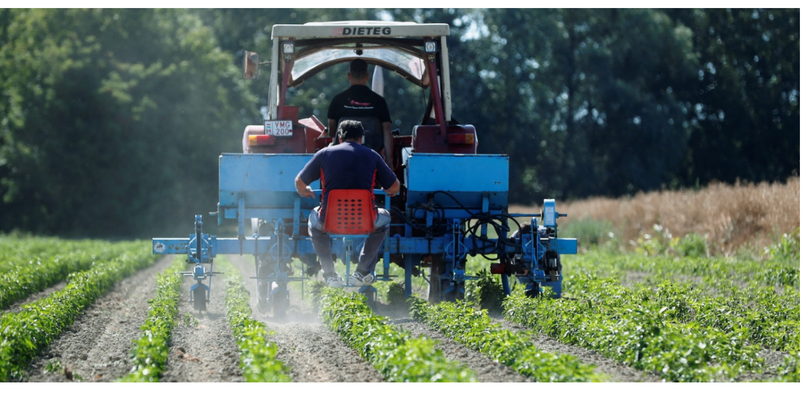
JUST AGRICULTURE | APRIL 2023 32

There are concerns about the potential health risks associated with nanofertilizers, particularly for workers exposed to these particles during manufacturing or